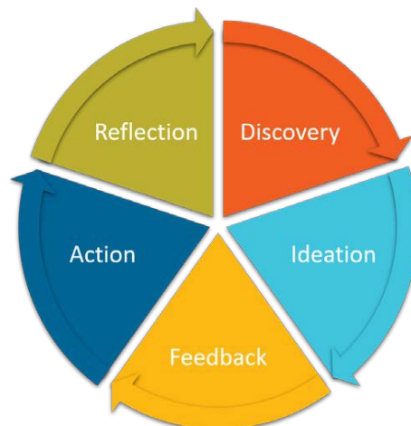
Figure 2: The Cycle of Engagement